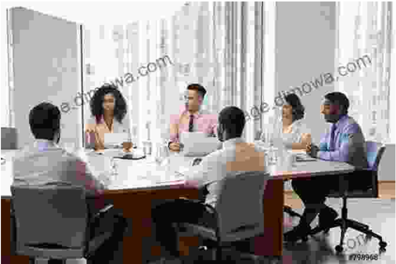
Image: Business professionals discussing a strategic alliance

To Free Download your copy of "Foreign Direct Investment and Strategic Alliances in Europe," please visit our website or contact your local bookseller.